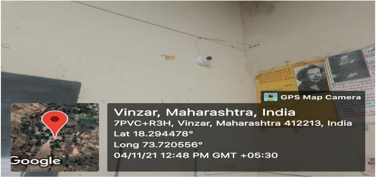
CCTV at Physics Laboratory