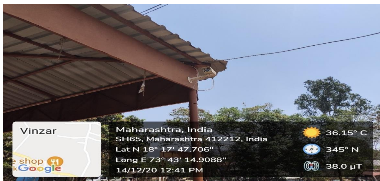
CCTV at college Campus