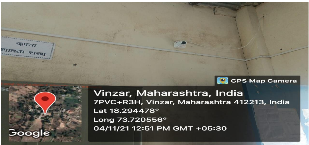
CCTV at Physics Laboratory